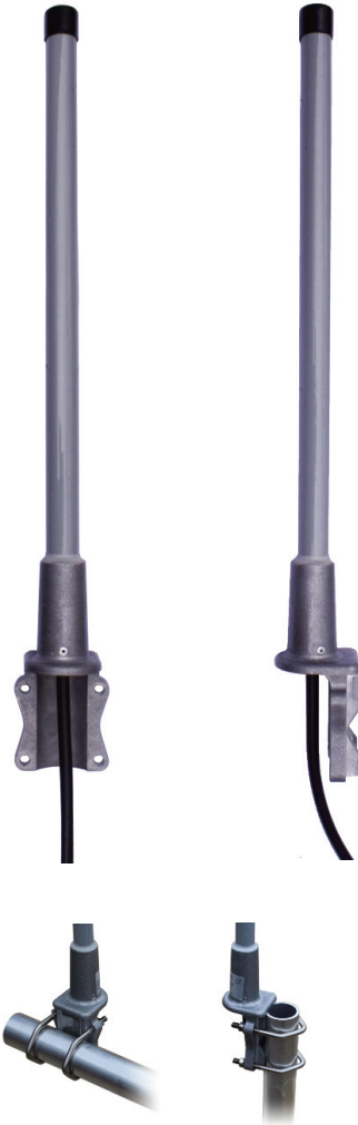
• Horizontal or vertical tube mount

The S.EFX series of glassfibre dipoles are designed for professional base station and fixed mobile applications. The antennas have been designed with an integral dual purpose mounting bracket, cast in aluminium. The stainless steel fittings enable the antennas to be fixed to the top or side of a vertical pole up to 60mm diameter. The centre fed dipole is fed via coaxial cable, giving a stable radiation pattern over a wide operating band. All S.EFX series are d.c. grounded. A VSWR of 1.5:1 is achieved over a bandwidth of \pm 6\% of centre frequency.